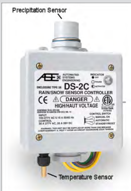
Round ice detector at the top